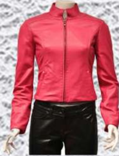
Female Leather Jackets